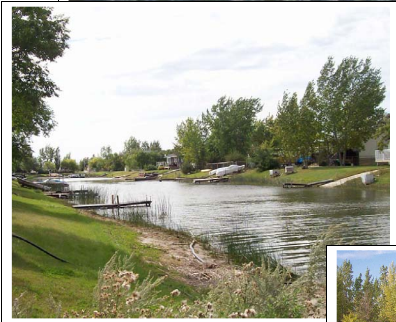
BOTTOM – Entrance to the canal at Sarnia Beach from Last Mountain Lake.