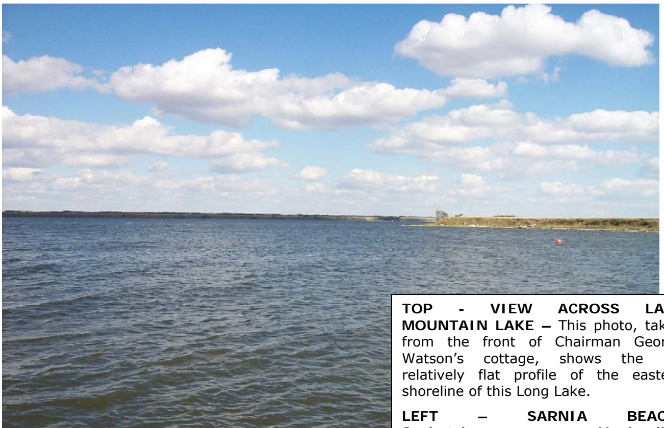
TOP - VIEW ACROSS LAST MOUNTAIN LAKE – This photo, taken from the front of Chairman George Watson’s cottage, shows the log relatively flat profile of the eastern shoreline of this Long Lake.