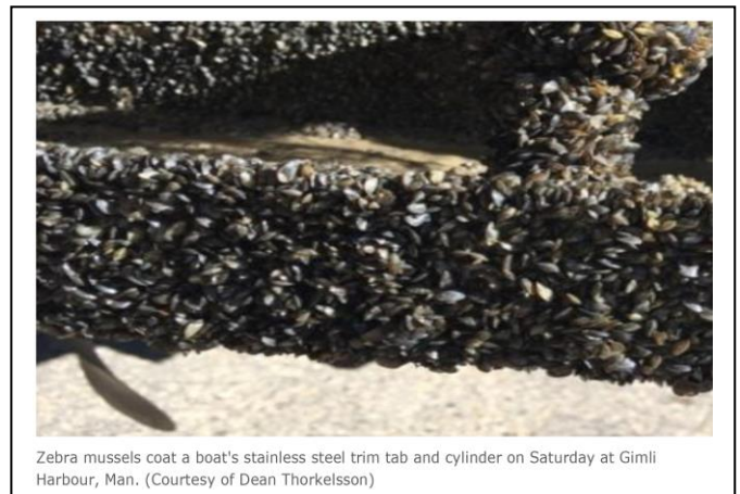
Zebra mussels coat a boat's stainless steel trim tab and cylinder on Saturday at Gimli Harbour, Man.

A preventative measure which has been employed — and the group would like to see expanded — is known as clean, drain and dry. Whenever a boat is removed from water, any water should be removed and it should be cleaned and scrubbed with hot water, dried and kept out of water for five days or so.