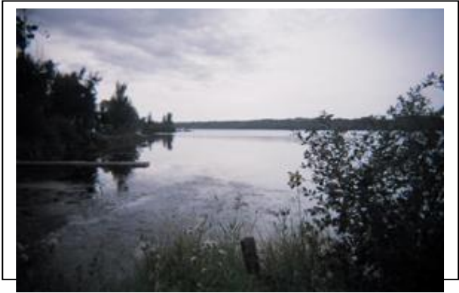
The east end of Wakaw Lake.